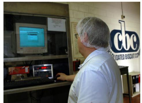
Portable workstations for measuring package weights

As the ideas developed, the possibilities did, too. Package labeling specifications should be accessible from the system so that the latest version was always available on the production floor. Pallet stacking diagrams should be accessible as well. Product lists should be line-specific, to speed the initial operator sign-in.